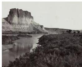
RUSSELL, ANDREW. THE GREAT WEST ILLUSTRATED. New York: 1869. With 50 albumen photographs, recording the building of the Union Pacific Railroad. Estimate: $150,000-250,000 Price Realized: $319,500