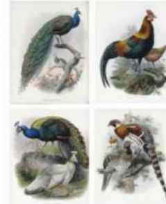
ELLIOT, Daniel Giraud. A Monograph of the Phasianidae or Family of the Pheasants. New York: by the author, [1870-]1872. Estimate: $60,000-80,000 Price realized: $87,500