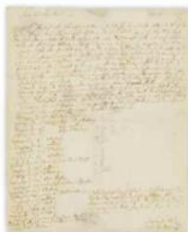
MOZART, Wolfgang Amadeus (1756-1791). Autograph letter Signed ('W: A: Mozart') to his father [Leopold: 'Mon très chere Père'], Vienna, 3 March 1784. Estimate: $200,000-300,000 Price realized: $319,500