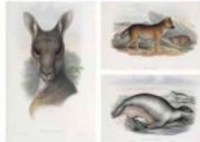
GOULD, John (1804-1881). The Mammals of Australia. London: Taylor and Francis for the Author, [1845]-1863. Estimate: $70,000-100,000 Price realized: $162,500