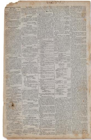
The Eric C. Caren Collection THE STAR-SPANGLED BANNER – Daily Federal Republican. Georgetown: 22 September 1814.

Estimate: $7,000- 10,000 Price realized: $168,750