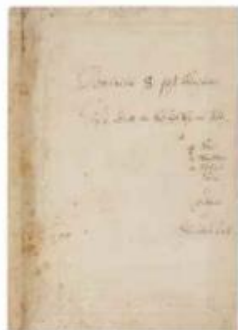
BACH, Johann Sebastian (1685-1750). Autograph manuscript signed ('Joh. Sebast: Bach'), the title page for the cantata BWV 178, 'Wo Gott der Herr nicht bei uns hält', n.p. [Leipzig], 'Dominica 8 post Trinitatis' [30 July 1724]. Estimate: $150,000-220,000 Price realized: $125,000