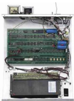
WORKING APPLE-1 PERSONAL COMPUTER. PALO ALTO, 1976. Price Realized: $355,500

Individual sales results with highlights are below.