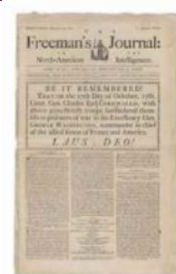
SURRENDER OF CORNWALLIS – The Freeman's Journal: or, the North-American Intelligencer. Philadelphia: Francis Bailey, October 24, 1781. No. 27. Estimate: $15,000-25,000 Price realized: $137,500