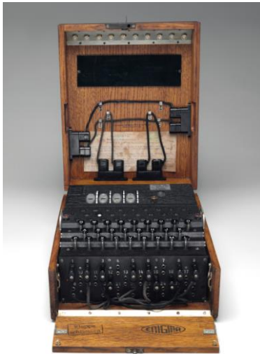
FOUR-ROTOR ENIGMA CIPHER MACHINE. HEIMSOETH & RINKE, 1944. PRICE REALIZED: $547,500