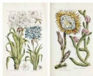
HILL, JOHN (CA 1714-1775). THE VEGETABLE SYSTEM. LONDON: THE AUTHOR, 1759-1773, 1786, 1774-1775. $100,000-150,000 Price realized: $199,500