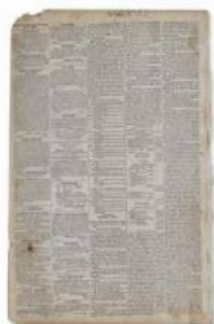
THE STAR-SPANGLED BANNER – Daily Federal Republican. Georgetown: 22 September 1814. Estimate: $7,000- 10,000 Price realized: $168,750