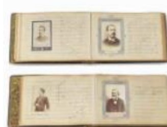
AUTOGRAPH ALBUM – COMPOSERS. 'Autographes de compositeurs célèbres', autograph musical quotations signed by composers and Lisians, most inscribed to Isaac Léon, Paris, 1892 – 1906. Estimate: $40,000-60,000 Price realized: $37,500