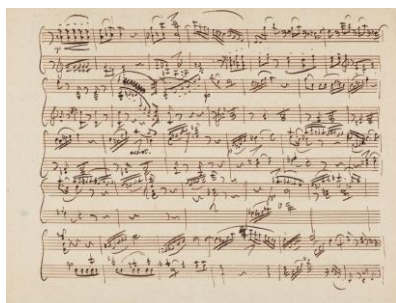
SCHUBERT, Franz (1797-1828). Autograph music manuscript signed ('Frz Schubert') for the Piano Sonata in A flat major, D.557, May 1817. Price Realized: $475,500