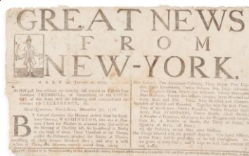
The only known copy of this "Great News" broadside announcing Washington's Crossing of the Delaware and signal victory at Trenton. Salem, MA: E. Russell, January 7, 1777. Estimate: $40,000-60,000 Price realized: $175,000