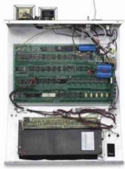
A WORKING APPLE-1 PERSONAL COMPUTER. PALO ALTO, 1976. Estimate: $300,000-500,000 Price Realized: $355,500