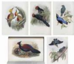
GOULD, John (1804-1881) and Richard Bowdler SHARPE (1847-1909). The Birds of Asia. London: Taylor and Francis for the author, 1850-1883. Estimate: $100,000-150,000 Price realized: $125,000