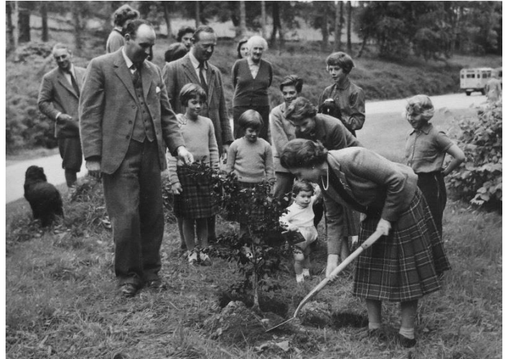
Tillypronie ( left ) and H.M. Queen Elizabeth II planting a tree at Tillypronie, 1960 ( right )