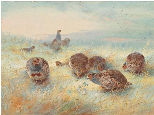
Archibald Thorburn (1860-1935), A frosty dawn Estimate: £50,000-70,000

Since Lord and Lady Astor bought Tillypronie in 1951, the celebrated collection of paintings, sketches, studies and bronzes has been a central element of the spectacular sporting estate. It is one of the greatest assemblies of paintings by Archibald Thorburn, along with an impressive array of works by George Edward Lodge. Throughout the auction, birds are the central motif that unites the artists, depicting a variety of British species including black and red grouse, ptarmigan, capercaillie, pheasant, partridge, duck and geese as well as birds of prey. Highlights include Thorburn's atmospheric Blackgame in the glen (estimate: £70,000–100,000, illustrated above right ), and A frosty dawn , dating from 1927 (estimate: £50,000-70,000, illustrated below ), which demonstrates his extraordinary handling of lighting and ability to capture the movement of birds. A wider interest in sporting art is evident in works such as Monarch of the Glen , a ten-point stag with three hinds, painted in 1901 (estimate: £12,000–18,000).