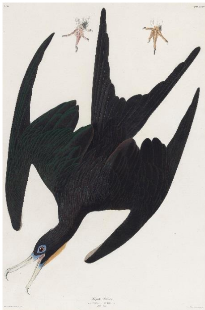
John James Audubon (1785 – 1851) Frigate Pelican Estimate: £7,000–10,000