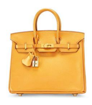
A METALLIC BRONZE CHÈVRE LEATHER BIRKIN 25 WITH GOLD HARDWARE, HERMÈS, 2005, €8,000—€10,000