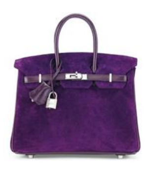
A RAISIN VEAU DOBLIS & CALF BOX LEATHER BIRKIN 25 WITH PALLADIUM HARDWARE, HERMÈS, 2004, €6,000—€8,000