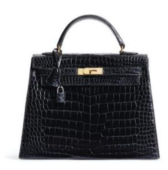
A SHINY BLACK POROSUS CROCODILE SELLIER KELLY 32 WITH GOLD HARDWARE, HERMÈS, 1959, €5,000—€7,000