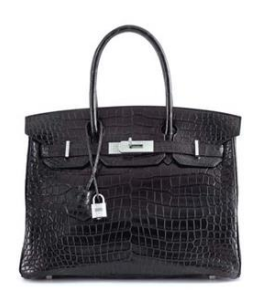
AN EXCEPTIONAL, MATTE BLACK POROSUS CROCODILE DIAMOND BIRKIN 30 WITH 18K WHITE GOLD & DIAMOND HARDWARE, HERMÈS, 2007, €70,000— €90,000