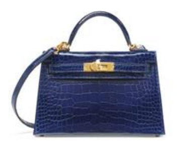
A SHINY BLEU SAPHIR ALLIGATOR SELLIER MINI KELLY 20 II WITH PALLADIUM HARDWARE, HERMÈS, 2016, €20,000—€30,000