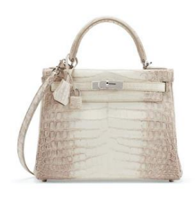
A RARE MATTE WHITE NILOTICUS CROCODILE HIMALAYA RETOURNÉ KELLY 28 WITH PALLADIUM HARDWARE, HERMÈS, 2014, €60,000—€80,000