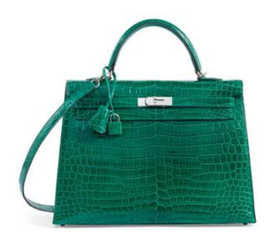
A SHINY VERT ÉMERAUDE POROSUS CROCODILE SELLIER KELLY 35 WITH PALLADIUM HARDWARE, HERMÈS, 2010, €15,000—€20,000