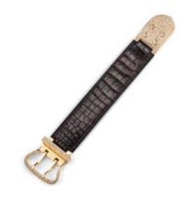
AN 18K ROSE GOLD, DIAMOND, & SHINY MARRON FONCE POROSUS CROCODILE BOUCLE SELLIER TGM BRACELET, HERMÈS, 2007, €20,000—€30,000