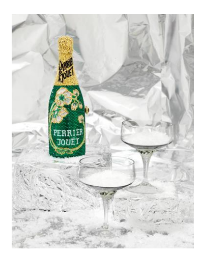
A GREEN & GOLD CRYSTAL PERRIER JOUET MINAUDIÈRE, No 173/2500, Kathrine Baumann, 2000, €1,500—€2,500