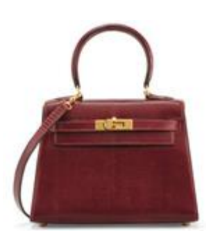
A ROUGE H LIZARD MINI KELLY 20 WITH GOLD HARDWARE, HERMÈS, 1994, €10,000—€12,000