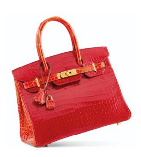
A CUSTOM SHINY BRAISE & GÉRANIUM POROSUS CROCODILE BIRKIN 30 WITH BRUSHED GOLD HARDWARE, HERMÈS, 2015, €40,000— €45,000