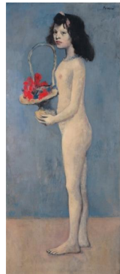
Pablo Picasso, Fillette à la corbeille fleurie Oil on canvas 60.7/8 x 26 in. (154.8 x 66.1 cm.) Painted in 1905