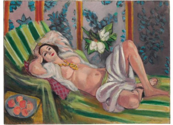
Henri Matisse Odalisque couchée aux magnolias Signed 'Henri - Matisse' (lower right) Oil on canvas 23.3/4 x 31.7/8 in. (60.5 x 81.1 cm.) Painted in Nice, 1923 Estimate in the region of $50 million

The most important work by Henri Matisse to be offered on the market in a generation is Odalisque couchée aux magnolias , painted in Nice in 1923 (estimate in the region of $50 million). The subject of the odalisque, the reclining female figure, held special significance for Matisse as it presented the opportunity to measure his art against past masters. Odalisque couchée aux magnolias , with its symphonic synthesis of pattern and form, has long been counted among the greatest of Matisse's paintings in private hands. This sumptuous painting resided in the living room of Peggy and David's Hudson Pines home. Odalisque couchée aux magnolias is also the highest estimated work by Matisse to ever be offered at auction.