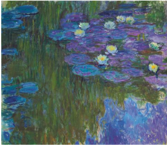
Claude Monet Nymphéas en fleur stamped with signature 'Claude Monet' (on the reverse) Oil on canvas 63.3/8 x 71.1/8 in. (160.9 x 180.8 cm.) Painted circa 1914-1917 Estimate in the region of $35 million