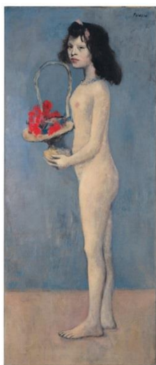
Pablo Picasso Fillette à la corbeille fleurie Oil on canvas 60.7/8 x 26 in. (154.8 x 66.1 cm.) Painted in 1905 Estimate in the region of $70 million