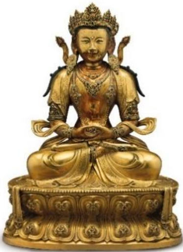
AN IMPERIAL GILT-BRONZE FIGURE OF AMITAYUS CHINA, KANGXI PERIOD (1662-1722) 16 1/2 in. (41.9 cm.) high Estimate: $400,000-600,000

Leading the Chinese works of art from the collection is a magnificent gilt-bronze figure of Amitayus made in the Imperial workshops by order of the Kangxi Emperor (reigned 1662-1722) (estimate: $400,000-600,000). In Chinese Buddhism, Amitayus is revered as the god of long-life, and it is likely this bronze was commissioned as a birthday gift for a member of the Imperial family. The Kangxi Emperor was a devout Buddhist, especially later in his life, and lavished patronage on Buddhist institutions. The substantial size and weight of this sculpture, and the fact that it was one of a celebrated group of such figures, means that a significant amount of material, both bronze and gold, was used in its creation.