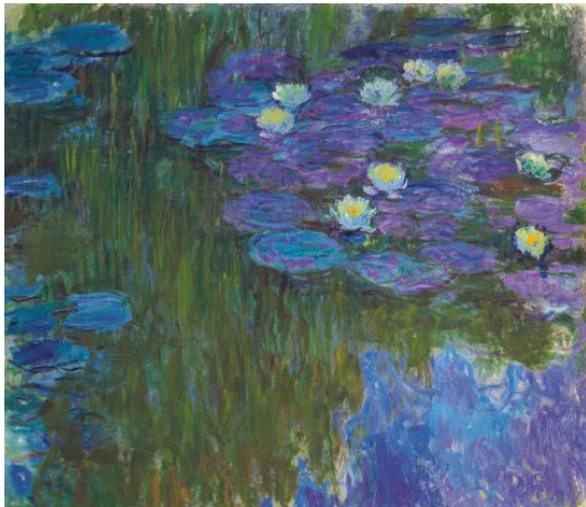
Claude Monet, Nymphéas en fleur Oil on canvas 63.3/8 x 71.1/8 in. (160.9 x 180.8 cm.) Painted circa 1914-1917