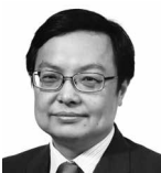
DAI DAI Beijing