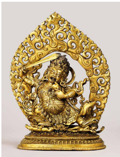
A GILT-BRONZE FIGURE OF BEGTSE CHEN QIANLONG PERIOD (1736-1795)