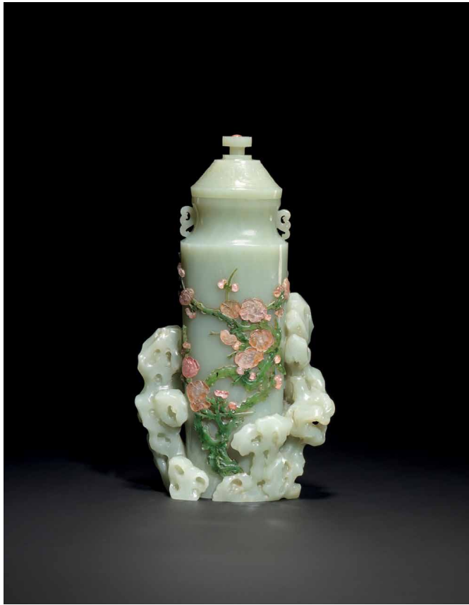
AN INLAID GREENISH-WHITE JADE VASE AND COVER QING DYNASTY, 18 TH CENTURY

Estimate: HK$800,000 - 1,200,000 Price realised: HK$3,000,000 / US$388,420