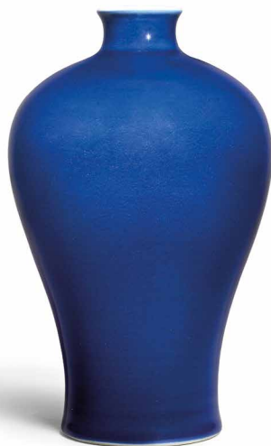
A SACRIFICIAL BLUE-GLAZED VASE, MEIPING YONGZHENG SIX-CHARACTER MARK IN UNDERGLAZE BLUE WITHIN A DOUBLE CIRCLE AND OF THE PERIOD (1723-1735)

Price realised: HK$3,250,000 / US$420,686