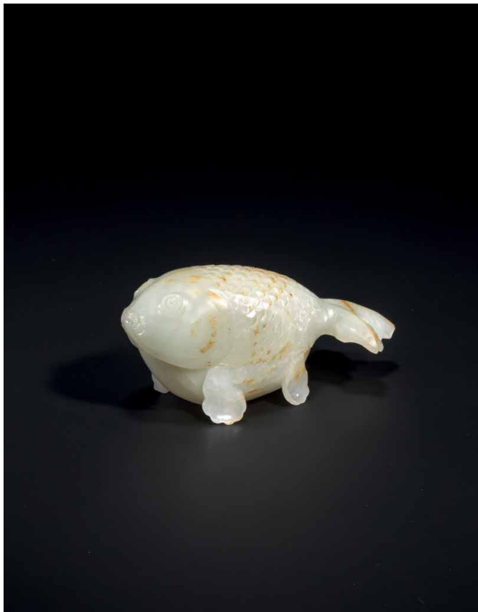
A FINELY-CARVED WHITE AND RUSSET JADE 'GOLDFISH' BOX AND COVER QING DYNASTY, 18 TH -19 TH CENTURY

Estimate: HK$80,000 - 120,000 Price realised: HK$1,875,000 / US$242,762