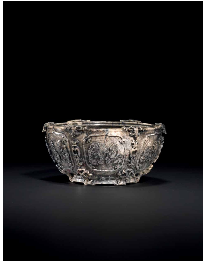
A CHICKEN BONE JADE 'ZODIAC ANIMALS' BOWL QING DYNASTY, 18 TH CENTURY

Estimate: HK$60,000 - 100,000 Price realised: HK$1,625,000 / US$210,394