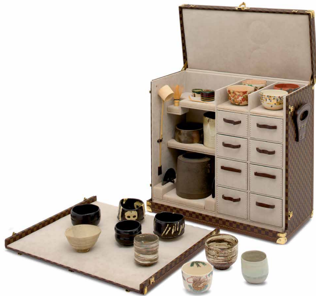
A SPECIAL ORDER JAPANESE TEA CEREMONY DAMIER TRUNK LOUIS VUITTON, 2006