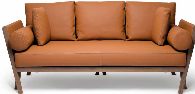
A GOLD CLÉMENCE LEATHER & GREY OAK WOOD MATIÈRES RECEPTION SOFA HERMÈS, 2022