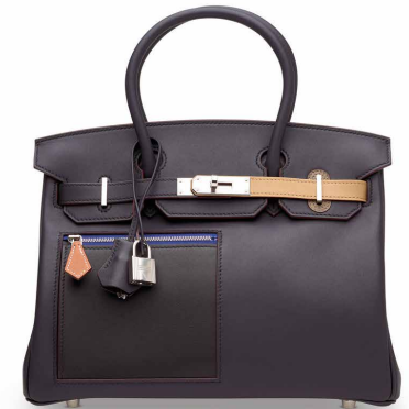
A LIMITED EDITION BLEU, NOIR, CHAI, ETOUPE & GOLD SWIFT LEATHER COLOMATIC BIRKIN 30 WITH PALLADIUM HARDWARE HERMÈS, 2022