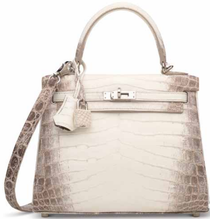
A RARE, MATTE WHITE HIMALAYA NILOTICUS CROCODILE RETOURNÉ KELLY 25 WITH PALLADIUM HARDWARE HERMÈS, 2020