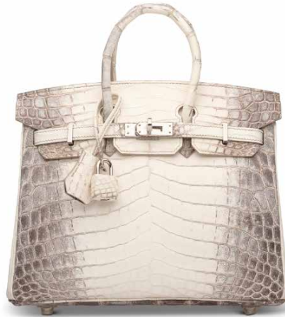
A RARE, MATTE WHITE HIMALAYA NILOTICUS CROCODILE BIRKIN 25 WITH PALLADIUM HARDWARE HERMÈS, 2020

Price Realised: HK$1,638,000 (US$210,675)