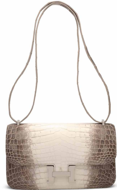
A RARE, CUSTOM MATTE WHITE HIMALAYA NILOTICUS CROCODILE CONSTANCE ÉLAN WITH PALLADIUM HARDWARE HERMÈS, 2020

Price Realised: HK$1,638,000 (US$210,675)