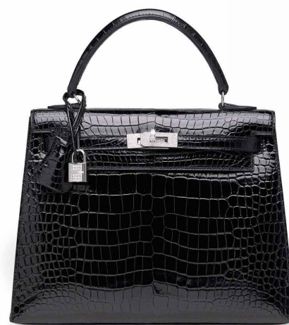
AN EXCEPTIONAL, SHINY BLACK POROSUS CROCODILE SELLIER KELLY 25 WITH 18K WHITE GOLD & DIAMOND HARDWARE HERMÈS, 2019

of lots bought by buyers new to Christie's