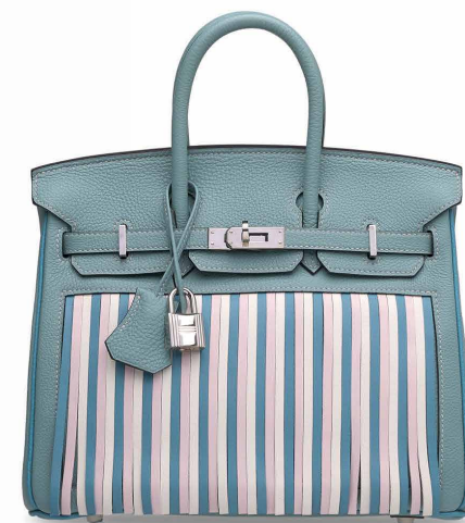
A CUSTOM CIEL & BLEU JEAN TOGO LEATHER FRINGE BIRKIN 25 WITH PALLADIUM HARDWARE HERMÈS, 2009

Price realised: HK$1,500,000/ US$194,369