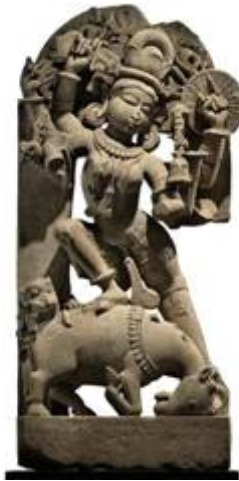
An important buff sandstone figure of Sachika India, Rajasthan, dated to 1179 Estimate: $200,000-300,000