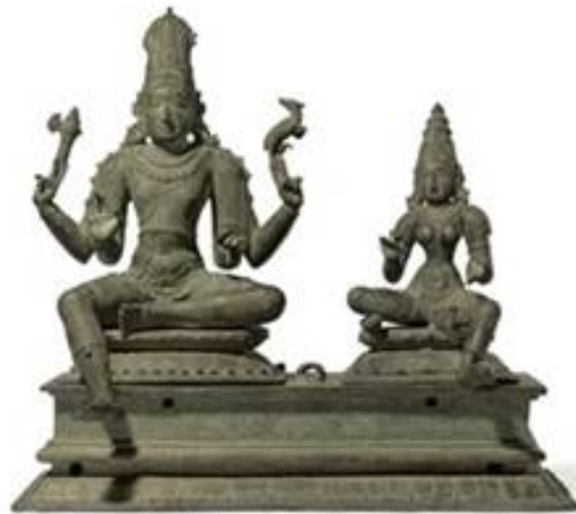
A large and important bronze group of Shiva and Uma as Somaskanda South India, Tamilnadu, Chola Period, 13th century Estimate: $600,000-800,000

New York- On March 20, concluding Asian Art Week, Christie's will offer a single owner collection, Highlights from the Star Collection: From India to Indonesia followed by Indian and Southeast Asian Art . Combined, the two sales will offer a superb selection of over 200 lots of sculpture, paintings, ritual objects, and works of art from India, Tibet, Nepal and Southeast Asia.