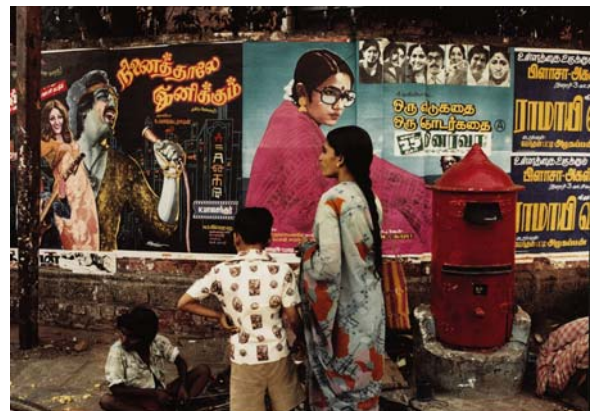
Maqbool Fida Husain Culture of the Streets , executed circa 1980s (1 of 32) Estimate: $12,000-18,000