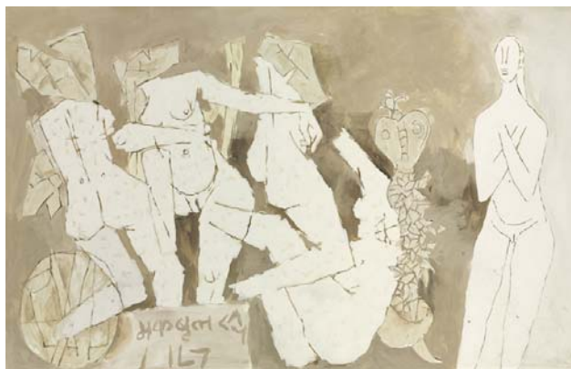
Maqbool Fida Husain Untitled oil on canvas, painted in 1971 Estimate: $500,000-700,000