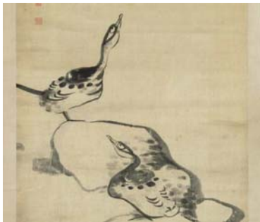
Birds and Ducks (detail, one of four) Bada Shanren (Zhu Da, 16226-1705) Estimate: $300,000-500,000

Fine Chinese Art from the Arthur M. Sackler Collections