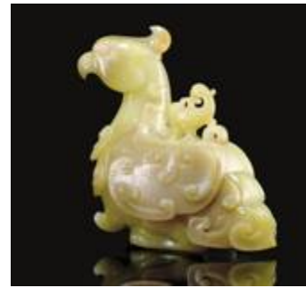
Yellow and creamy-beige jade archaic phoenix-form vessel and cover Estimate: $100,000-150,000

Chinese Jades from the Fine Arts Museums of San Francisco