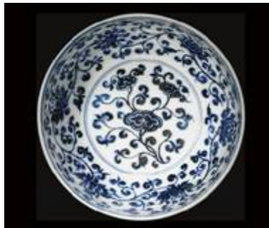
Important and very rare blue and white basin Yongle Period (1403-1425) Estimate: $400,000-600,000

Chinese Jades from the Fine Arts Museums of San Francisco