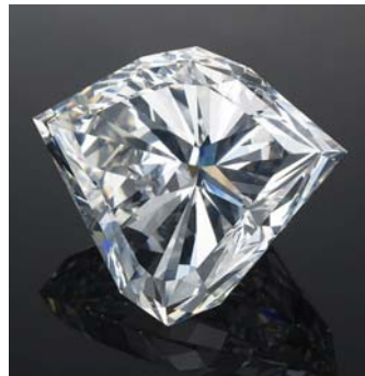
A 101.27ct, F colour shield shaped diamond (estimate: $6 million to $8 million)