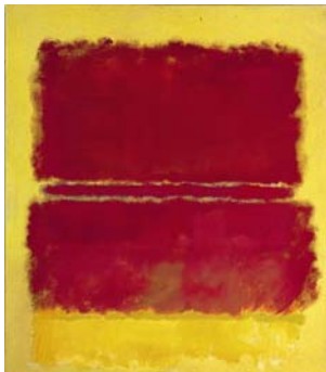
Mark Rothko No. 15 , 1952 (estimate on request)