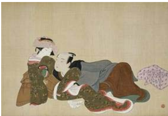
Katsukawa Shunsho Nine erotic scenes from Secret Games in the Spring Palace ( Shungu bigi ), late 1770s-early 1780s (one of nine) Estimate: $500,000-700,000