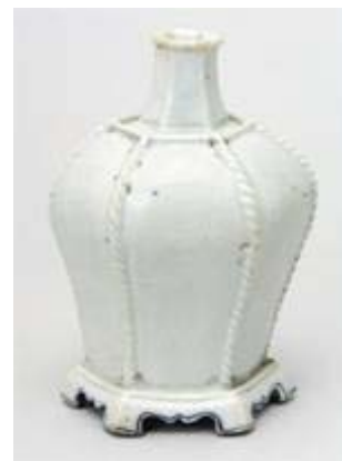
A bevelled and moulded blue and white porcelain bottle Joseon Dynasty (19 th century) Estimate: $220,000-280,000