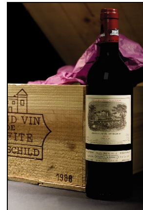
1988 Château Lafite-Rothschild 10 case lots, all in original wooden cases Estimate: $2,800-4,000 per lot Other vintages and sizes available

New York — Christie's International Wine Department is pleased to announce details and sale dates for its Spring 2009 auction season, beginning with an exceptional sale of fine and rare wines on Saturday, March 28. To kick off the season, Christie's will host the first in a new series of complimentary Champagne brunch events for registered bidders at its Rockefeller Center salesrooms.