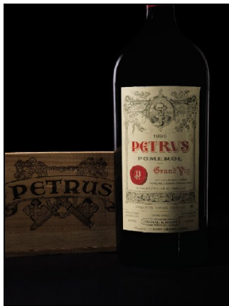
1995 Château Pétrus Three impériales (6 litres) Estimate: $7,000-10,000 per lot Standard bottle sizes also available