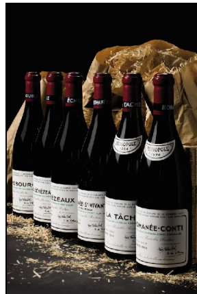
1994 Domaine de la Romanée-Conti Assorted vineyards, one dozen bottles Estimate: $3,000-5,000 per lot 1993 assorted case also available