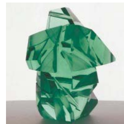
Michael's martial arts form

The attempt of Ramon Orlina (born in 1944) to make his vision comprehensible and to crystallize it for a contemporary audience is shown by Michael's martial arts form 07-01 (Lot 15, Estimate: HK$30,000-40,000/ US$3,900-5,100).