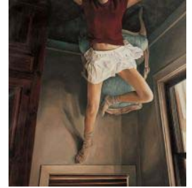
The absurdity of being

Equally eye-catching is the quirky kinetic sculptural work Tree of life – reaching out by Gabriel Barredo (born in 1957) (Lot 32, Estimate: HK$35,000-50,000/US$4,500-6,400), where history and fantasy are richly interwoven, reflecting his passion for classical objects that still shine in people's minds, such as opera and ballet.