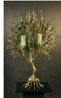
Tree of life – reaching out

Equally eye-catching is the quirky kinetic sculptural work Tree of life – reaching out by Gabriel Barredo (born in 1957) (Lot 32, Estimate: HK$35,000-50,000/US$4,500-6,400), where history and fantasy are richly interwoven, reflecting his passion for classical objects that still shine in people's minds, such as opera and ballet.