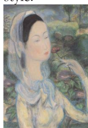
Jeune fille à la fleur

Further highlight includes a large oil on canvas work evocative of Le Pho's later, more Impressionist style La cueillette des poppies ( Gather the poppies ) (Lot 67, Estimate: HK$320,000-400,000/ US$41,000-51,300). On the other hand, Jeune fille à la fleur ( Young girl with flower ) (Lot 64, Estimate: HK$400,000-550,000/ US$51,300-70,500) is a classic female portrait painted with delicate attention to the portrayal of light and colour.