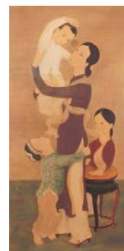
Une mère et ses 3 enfants

Christie's is also delighted to present an extraordinary assemblage of works during the centennial celebration of another renowned artist, Le Pho. This collection comprehensively illustrates the artist's vast repertoire and versatility in various media. Taking centre-stage is Une mère et ses 3 enfants ( A mother with her 3 children ) (Lot 63, Estimate: HK$800,000-1,000,000/ US$102,600-128,200), an exceedingly rare early work on silk by Le Pho. The artist uses a fine paint brush with ink and colour on silk to depict a mother playing with her three children. He also successfully combines the elegance and gracefulness reminiscent of Chinese silk paintings with a predominantly classical Western style.