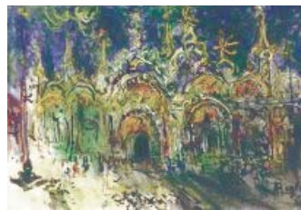
St. Mark's Square

Highlights in this collection include Cockfight (Lot 81, Estimate; HK$650,000-800,000/ US$83,400-102,600), St. Mark's Square (Lot 86, Estimate: HK$480,000-650,000/ US$61,600-83,300), and Balinese dancer (Lot 38, Estimate: HK$650,000-800,000/ US$83,300-102,600). Superbly executed in the prime years of Affandi's career, these works best demonstrate the artist's unique compositions constructed in clusters of smears of paint. Varied colours and textures allow whatever subject is depicted to float across the surface of the canvas, and to be animated only by the ebullient brushwork that never fails to convey an atmospheric effect.