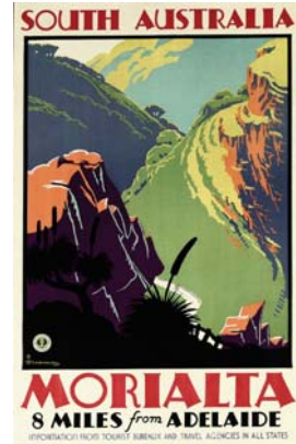
MILLWARD GREY, F MORIALTA Estimate: £1,500-2,000