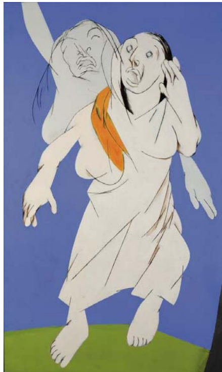
Tyeb Mehta (1925-2009) Two Figures , 1994 Estimate: $600,000-800,000