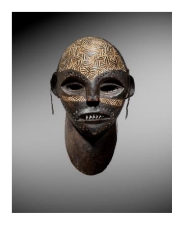
ill.3 LUBA MASK DEMOCRATIC REPUBLIC OF THE CONGO Estimate: €1,500,000-2,000,000

The African collection includes a remarkable group of five works from the Gabonese equatorial forest. The exceptional Fang head once owned by Maurice de Vlaminck (ill. 1), which has not been exhibited since November 1930, stands alongside the Fang reliquary figure byeri acquired by the architect Josep Lluis Sert in 1929. The famous Kota helmet, which once sat near the Demoiselles d'Avignon at the home of the couturier Jacques Doucet (ill. 2), is displayed alongside Léonce-Pierre Guerre's Fang ngil mask, Pierre Loti's Mahongwe and a moving Tsogho bust.