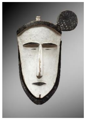
ill.7 TAPUANU MASK CAROLINE ISLAND Estimate: €500,000-700,000

Another sumptuous ensemble, this time of Polynesian origin, the four Easter Island works in the Périnet collection, range from the abstraction of the rapa dance paddle (ill. 6) to the powerful expressionism of the "ribbed man" moai kavakava . They are among the most accomplished examples of Easter Island aesthetics from the classical period.