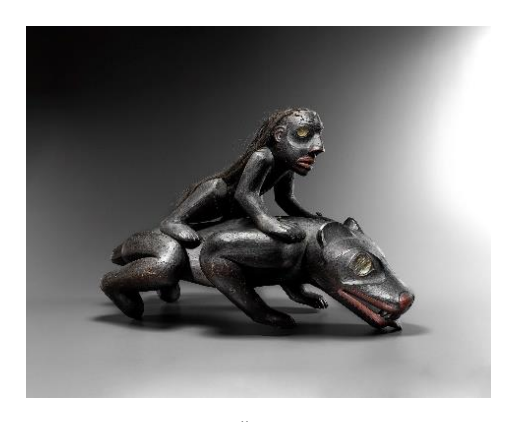
ill. 10 HAÏDA HEADRESS BRITISH COLOMBIA

sights on modern painting, particularly on the work of Francis Picabia, and finally discovered the arts of Africa and Oceania, a passion that would never leave him.