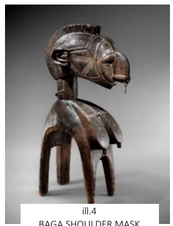
BAGA SHOULDER MASK GUINEA Estimate: €800,000-1,200,000

The African collection includes a remarkable group of five works from the Gabonese equatorial forest. The exceptional Fang head once owned by Maurice de Vlaminck (ill. 1), which has not been exhibited since November 1930, stands alongside the Fang reliquary figure byeri acquired by the architect Josep Lluis Sert in 1929. The famous Kota helmet, which once sat near the Demoiselles d'Avignon at the home of the couturier Jacques Doucet (ill. 2), is displayed alongside Léonce-Pierre Guerre's Fang ngil mask, Pierre Loti's Mahongwe and a moving Tsogho bust.