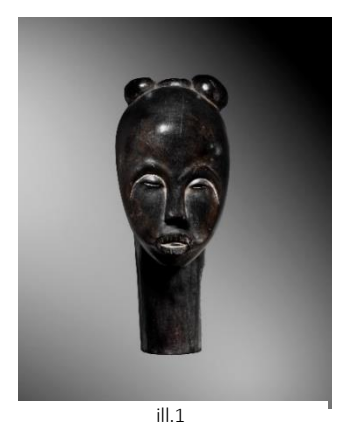
FANG HEAD Estimate: €2,000,000-3,000,000