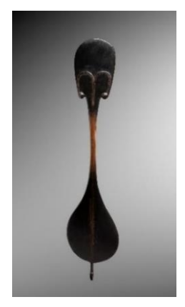
ill.6 RAPA DANCE PADDLE, EASTER ISLAND Estimate: €700,000-1,000,000