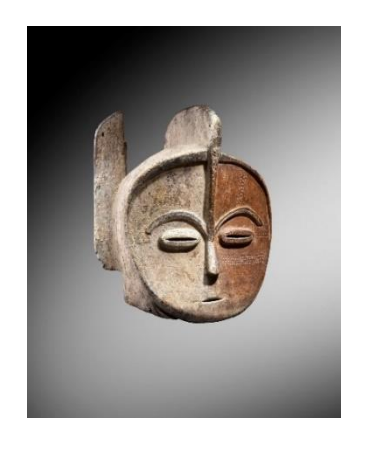
ill.2 KOTA MASK GABON Estimate: €300,000-400,000