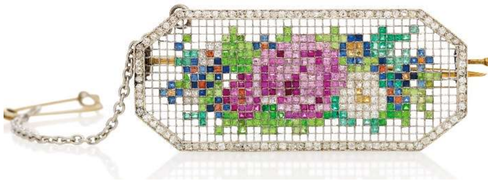
An important jewelled gold and platinum mosaic brooch by Fabergé , St Petersburg, circa 1913 , 1 \frac{1}{4} in. (4.3 cm.) long Estimate £70,000 – 90,000 Realised £350,000

ACHIEVING MORE THAN DOUBLE THE PRE-SALE LOW ESTIMATE