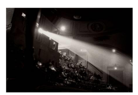
DIANE ARBUS (1923–1971) 42nd street movie theater audience, N.Y.C., 1958 gelatin silver print, flush-mounted on board image/sheet/flush mount: 6 1/2 x 9 7/8 in. (16.5 x 25 cm.) This work was printed by Diane Arbus. $25,000-35,000

PRESS CONTACT: Jessica Stanley | 212 636 2680 | jstanley@christies.com