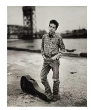
RICHARD AVEDON (1923–2004) Bob Dylan, Folk Singer, New York City, 1963 gelatin silver print, printed 1967 image: 19 1/2 x 15 1/2 in. (49.5 x 39.3 cm.) $40,000-60,000