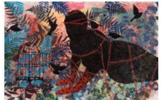
Time, Space, Existence: Afro-Futurist Visions from Galerie Myrtis MOREL DOUCET Black Maiden (The Caged Bird Sings a Soliloquy of Midnight Veil) Mix-media (acrylic and ink on paper with glitter, spray paint, watercolor paper, oil pastels, and fabric)