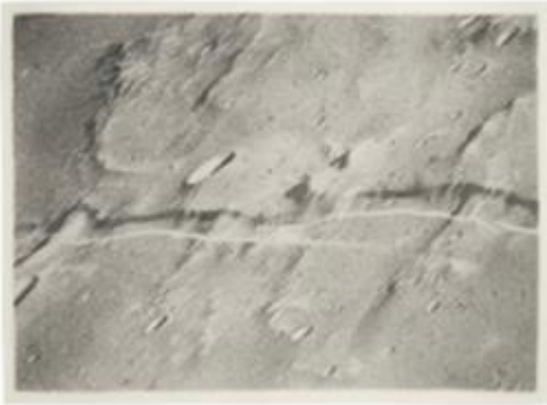
VIJA CELMINS (B. 1938) Untitled (Moon Surface #1) graphite on acrylic ground on paper 13 5 / 8 x 18 1 / 2 in. (34.6 x 47 cm.) Executed in 1969. Estimate: $600,000-800,000