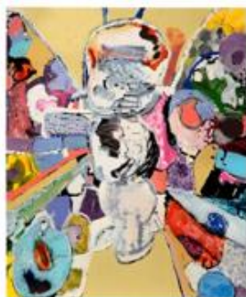
Flourish: Art For The Future — Supporting a Cure for STXBP1 Disorders