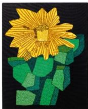
Flourish: Art For The Future — Supporting a Cure for STXBP1 Disorders

“I also want to acknowledge every STXBP1 parent, rare disease parent and caregiver who wake up every day and find the strength to care and advocate for the needs of their child. We see you! To each of the STXBP1 children, you are pure love and relentless determination, this is for each of you.”