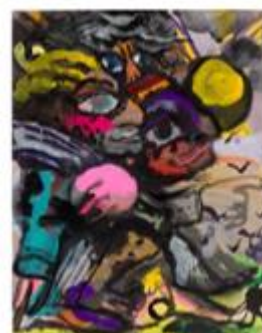
Flourish: Art For The Future — Supporting a Cure for STXBP1 Disorders