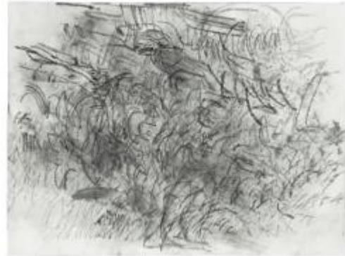
JULIE MEHRETU (B. 1970) Untitled acrylic, ink and graphite on canvas 18 x 24 in. Executed in 2012. Estimate: $500,000 - 700,000