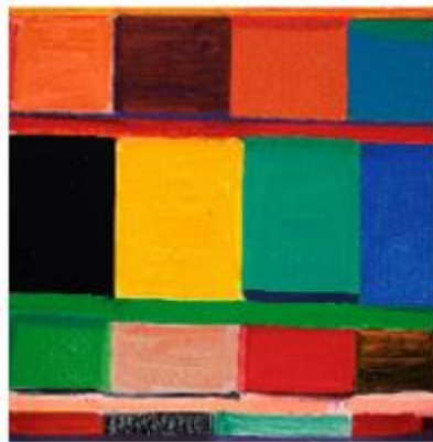
STANLEY WHITNEY (B. 1946) Midnight Hour oil on canvas 60 7 / 8 x 60 7 / 8 in. (152.7 x 152.7 cm.) Painted in 2016. Estimate: $400,000-600,000