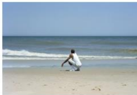
Time, Space, Existence: Afro-Futurist Visions from Galerie Myrtis LARRY COOK Untitled Hahnemuhle baryta fine art paper Edition 1 of 3 42 x 64.5 inches