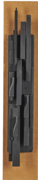
Martial Raysse, Bien sûr le petit bateau (1963, estimate: £400,000-600,000) and Louise Nevelson, Untitled (1959, estimate : £25,000-35,000)