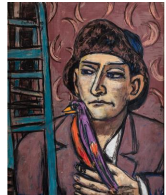
MAX BECKMANN (1884-1950) Mann mit Vogel oil on canvas Painted in New York in 1950 Estimate: $2,000,000-3,000,000