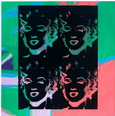
ANDY WARHOL (1928-1987) Four Multicolored Marilyns (Reversal Series) acrylic and silkscreen ink on canvas Painted in 1979-1986 Estimate: $3,000,000-5,000,000