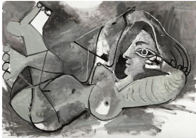
PABLO PICASSO (1881-1973) Nu couché oil and Ripolin on canvas Painted on 13 October 1968 Estimate: $10,000,000-15,000,000