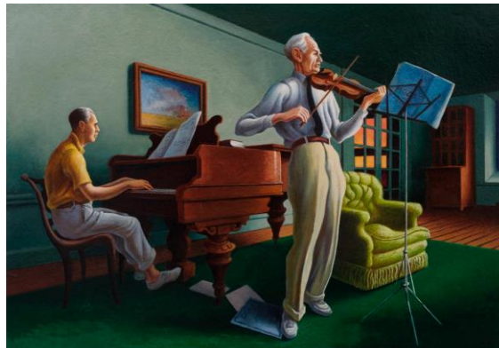
THOMAS HART BENTON (1889-1975) Evening Concert oil and tempera on gessoed board Painted circa 1952-63 Estimate: $1,500,000-2,500,000