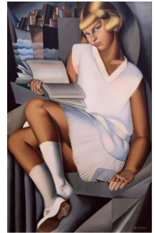
TAMARA DE LEMPICKA (1898-1980) Fille en rose oil on canvas Painted circa 1928-1930 Estimate: $7,000,000-10,000,000

NEW YORK – Christie's is honored to announce The Collection of Jerry Moss will be sold this November during the fall Marquee Week of Sales. Widely known as the "M" in A&M Records, Jerry Moss was a music industry giant who played a critical role in establishing careers of the biggest musical acts in history—Sting, Janet Jackson, Peter Frampton, Cat Stevens, Carole King, and countless more.