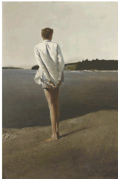
Above The Narrows, tempera on panel by Andrew Wyeth

New world auction records set for Guy Pène du Bois and John Joseph Boyle