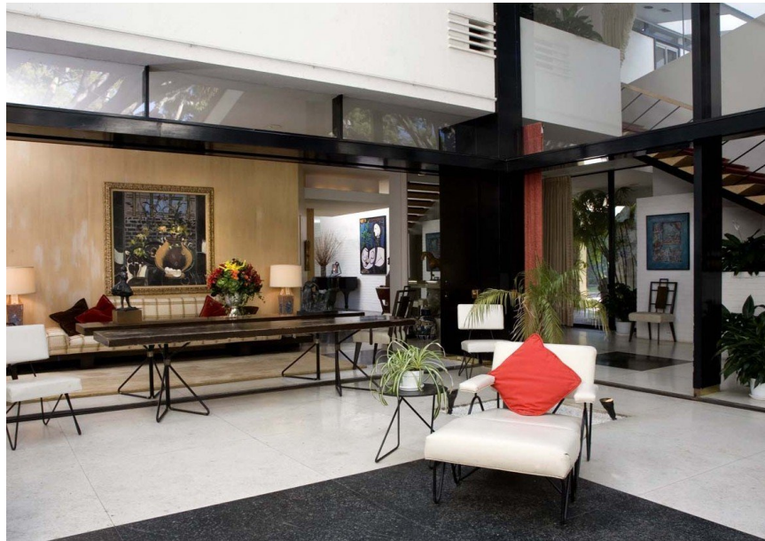
Interior of the Brody Residence, Holmby Hills, CA Designed by A. Quincy Jones with interiors by William (Billy) Haines