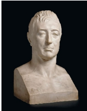
Jean-David d'Angers (1788-1856) Le marquis de La Fayette, 1829 White marble bust Estimate: €40,000-60,000