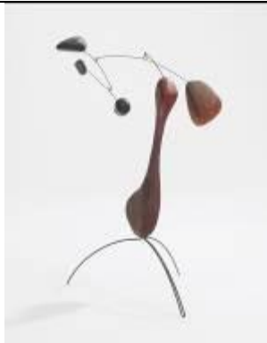
ALEXANDER CALDER (1898-1976) Wood stabile , 1945 H: 26.5 cm Estimate: £350,000-450,000 (US$600,000-750,000)