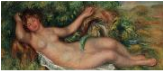
PIERRE-AUGUST RENOIR (1841-1919) Nu allongé , 1902 Oil on canvas Signed lower right 67.3 x 154 cm Estimate: £4-6 million (US$7-10 million)