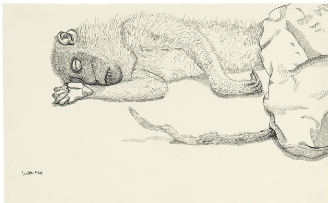
Lucian Freud, Dead Monkey , circa 1944