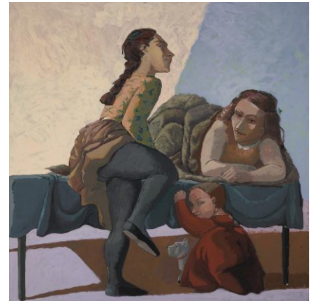
Paula Rego, Looking Back , 1987

- At the now pivotal exhibition of Paula Rego's paintings at the Serpentine Gallery in 1988, Kay and Charles Saatchi immediately recognized the sea change that had taken place in her work and purchased several pieces including Looking Back , 1987 (estimate: £600,000 to £800,000). In this large scale masterpiece, Rego introduces the monumentality and chiaroscuro that marked a turning point in her oeuvre. The work has particular emotional resonance having been painted soon after the tragic death of Rego's beloved husband and mentor, the towering British artist Victor Willing.