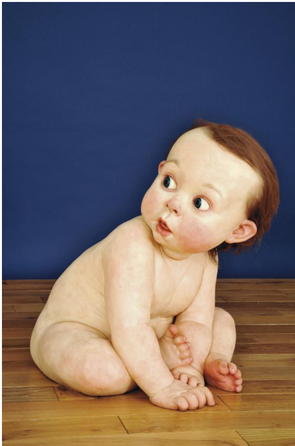
Ron Mueck, Big Baby , 1996

Highlights include the most outstanding group of Lucian Freud drawings to come to auction, Ron Mueck's spectacular Big Baby and a moving masterpiece by Paula Rego