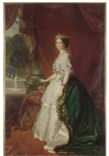
L'impératrice Eugénie, by Franz Xaver Winterhalter

The two rectangular-cut emeralds weighing 17.97 and 15.99 carats, with diamond set ring and pendant fitting by Meister, are now offered for sale with an estimate of SFr.200,000-300,000; illustrated above left ). The sale of these gems is a unique opportunity to acquire historic stones.