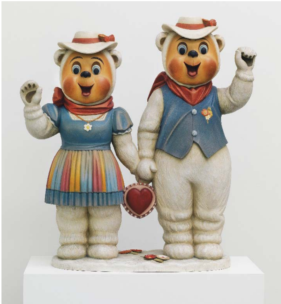
Jeff Koons (b. 1955), Winter Bears , 1988 Estimate: £2.5 million to £3.5 million