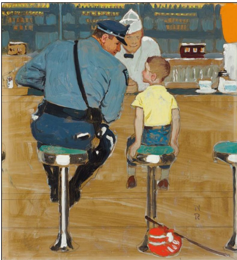
Norman Rockwell Study for 'The Runaway' oil on paper laid down on board Estimate: $80,000 – $120,000

New York – Christie's is pleased to announce the September Sale of American Art in New York on September 25. Lead by two superb Norman Rockwell drawings, the sale features over 160 lots by eminent American artists, including Greg Wyatt, Mary Cassatt, and Mario Korbelt, among others. Comprised of Impressionism, Modernism, Westerns, Illustrations, and bronzes, and with estimates ranging from $3,000 to $120,000, the sale caters to collectors at all levels and of all interests. The sale is expected to realize in excess of $2.5 million.