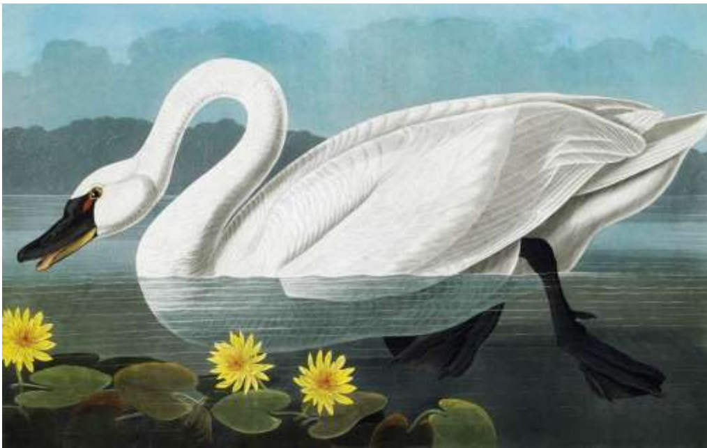
Audubon, John James (1785-1851), The Birds of America; from Original Drawings , 1827-1838

ESTIMATED AT $7 TO 10 MILLION- FIRST FOLIO EDITION OF JOHN JAMES AUDUBON'S THE BIRDS OF AMERICA TO BE SOLD JANUARY 2012