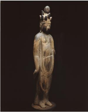
Standing Figure of Juichimen Kannon (Eleven-Headed Kannon) Heian Period (10th - 11th century) Wood ©Hiroshi Sugimoto Courtesy of Gallery Koyanagi

HIGHLIGHTED BY AN OPENING EXHIBITION FEATURING A SELECTION OF WORKS BY THE ARTIST INCLUDING WORKS FROM HIS PERSONAL COLLECTION