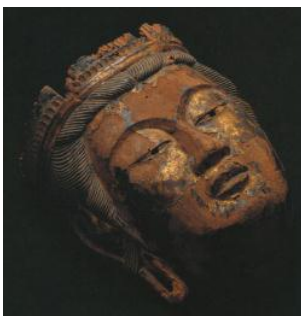
Gyodomen (Gyodo Mask) Heian Period (10th - 11th century) Wood and gold leaf over lacquer

Hiroshi Sugimoto comments: "In harmony and respect...What manner of design might befit the Tokyo office of Christie's, to best reflect its leading role in the booming world art market?"