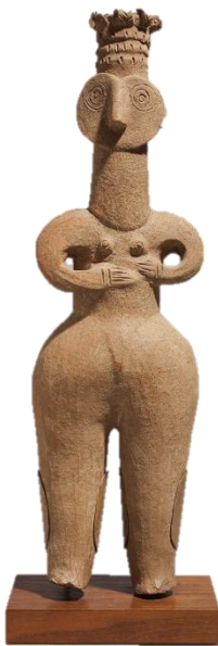
An Iranian Terracotta Female Figure Circa Early 1 st Millennium B.C. 19 5 / 8 in. (49.9 cm.) high Estimate: $20,000-30,000