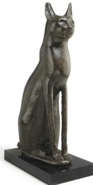
A Large Egyptian Bronze Cat Third Intermediate Period, Dynasty XXI-XXII, 1070-712 B.C. 23 1 / 2 in. (59.7 cm.) high Estimate: $200,000-300,000