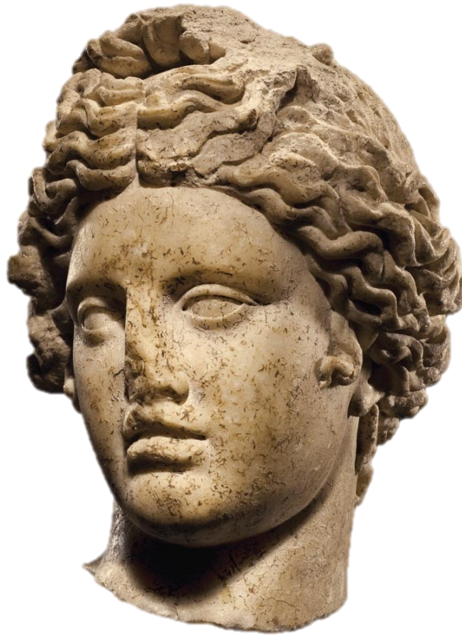
A Roman Marble Head Of Apollo Lyceus Circa 2 nd Century A.D. Estimate: $200,000 - 300,000

CHRISTIE'S SALE OF ANTIQUITIES ON DECEMBER 5