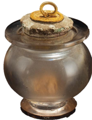
A Greek Rock Crystal Jar With A Gold And Glass Lid Hellenistic Period, Circa 2 nd -1 st Century B.C. 2 3 / 8 in. (6 cm.) high Estimate: $100,000-150,000