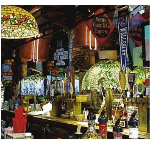
The bar at Eddie Rickenbacker's