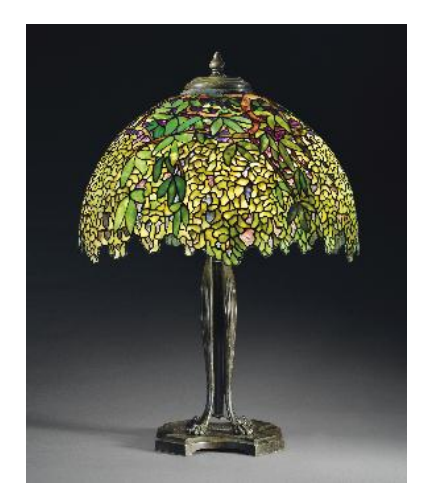
Tiffany Laburnum lamp estimate: $400,000-600,000

New York – On Thursday, June 14, Christie's is pleased to offer A San Francisco Iconoclast: Henry Africa's Magnificent Tiffany Collection , comprising seven beautifully crafted leaded glass lamps valued at $2 million. Originator of the "fern bar" concept, Norman Jay Hobday opened the bar Henry Africa's at the corners of Polk and Broadway, (later moved to Van Ness and Vallejo) in San Francisco. The décor of a "fern bar" was defined by its hanging fern planters, warm lighting and comfortable antique furnishings which transformed the bar scene into a safe place to socialize for the growing ranks of young urban professionals at the dawn of the 1970s. He officially took the name of the bar as his own and over the next five decades, opened several equally eclectic dining and drinking establishments, including Eddie Rickenbacker's , which opened in 1987 in San Francisco's financial district. Africa decorated Rickenbacker's with several of his beloved collections: vintage motorcycles, model trains, Venetian glass chandeliers and superb Tiffany lamps.