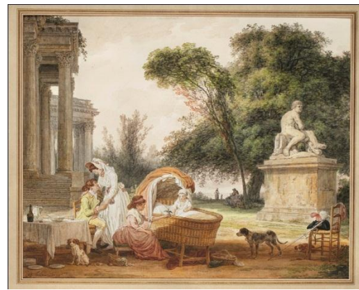
Jean-Baptiste Hilaire (1753-After 1822) L'Heureuse famille