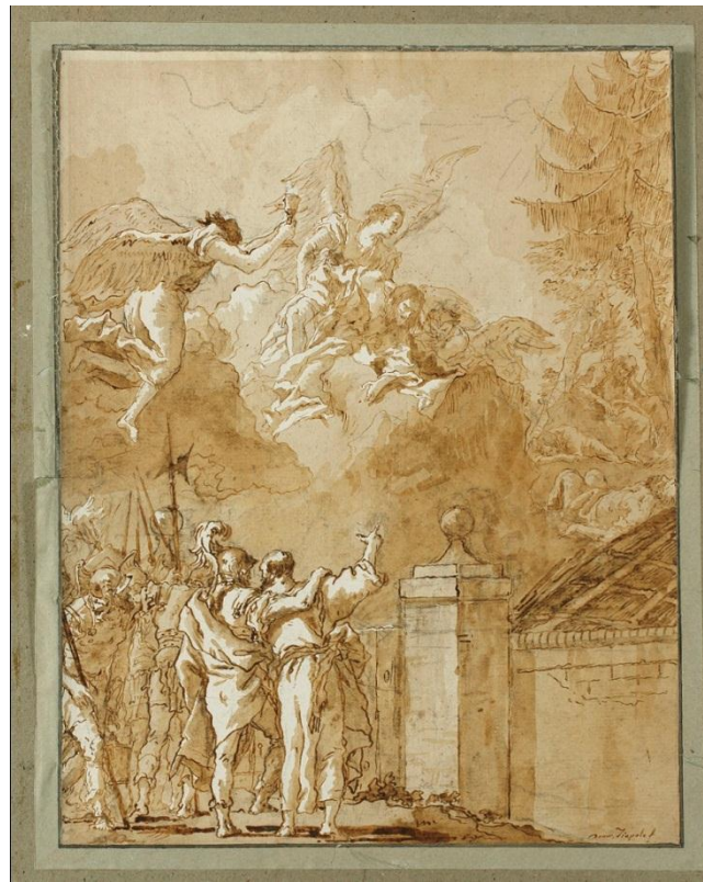
GIOVANNI DOMENICO TIEPOLO (1727-1804)