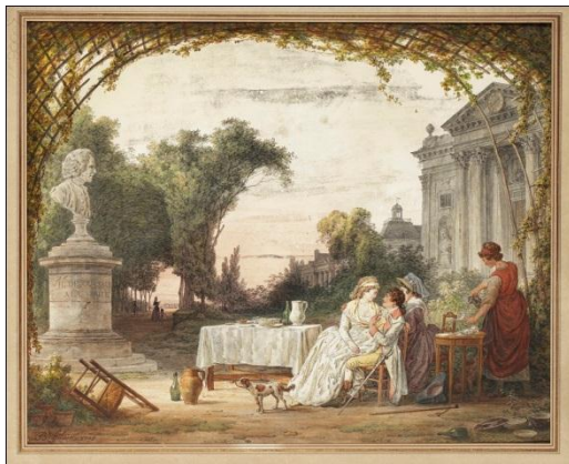
Jean-Baptiste Hilaire (1753-After 1822) Le Déjeuner

The French XVIII th century section contains a rich selection of works including an important drawing by Louis-Joseph-François Watteau (1758-1823); Un homme assis tenant un gourdin executed in charcoal and chalk, is expected to realise €6,000-8,000. Other highlights include an important pair of watercolors by Jean-Baptiste Hilaire (1753-after 1822) executed in 1795 and exhibited at the Salon of 1796, Le déjeuner and l'Heureuse famille are estimated €30,000-50,000 together (illustrated below).