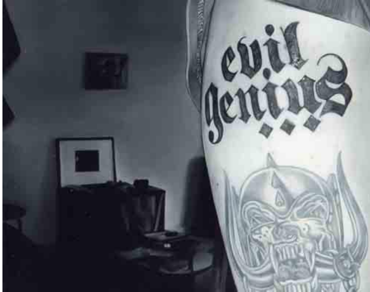
JAMES WHITE (B. 1967)

New Tattoo oil on plywood Painted in 2003