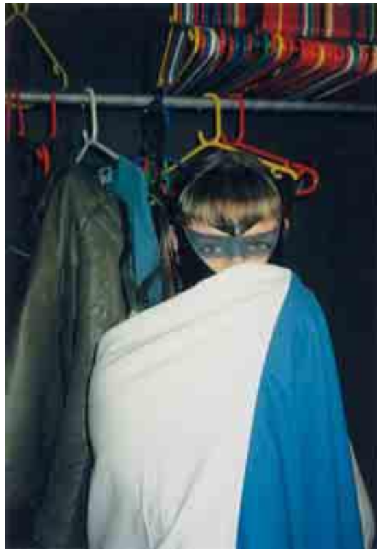
WOLFGANG TILLMANS (B. 1968), Miss Kittin , c-print, 2001 Estimate: £2,000-4,000 (US$3,100-6,000 / €2,300-4,500)

Christie's London – 8 King Street, St. James's Tuesday 20 November 2012 at 1.00 pm