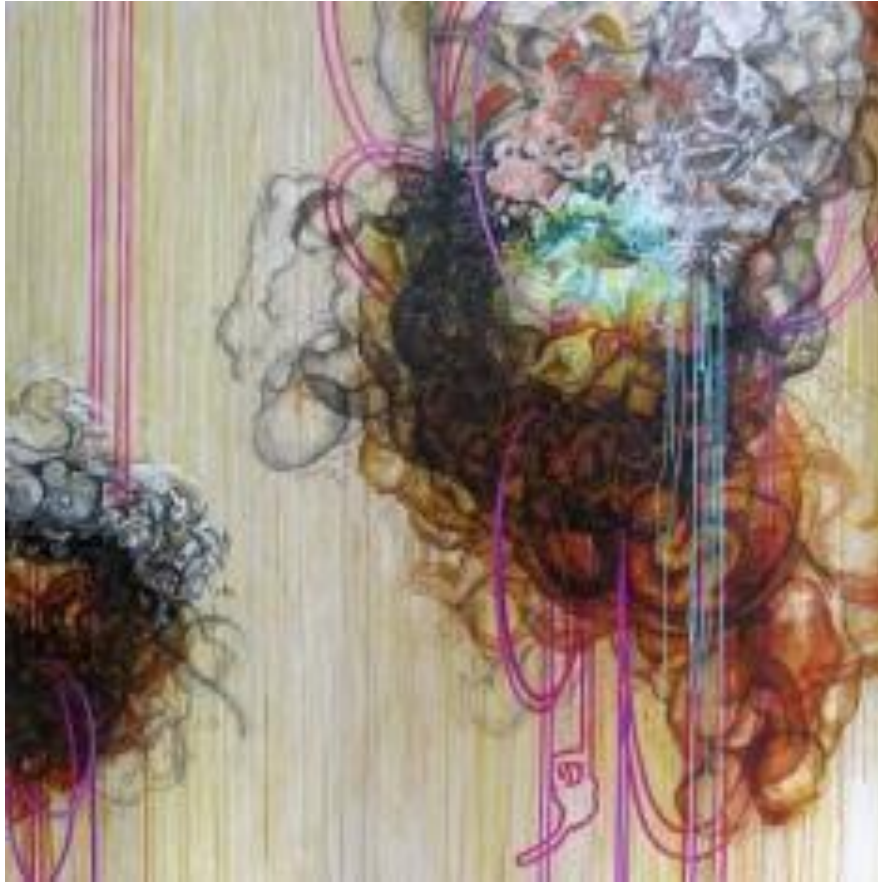
Ayad Alkhadi, At the Beginning . Estimate: $35,000-$45,000

Modern and Contemporary Arab, Iranian and Turkish Art October 23 & 24, 2012 Sponsored by Zurich