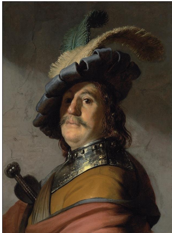
Rembrandt Harmensz van Rijn (1606-1669)