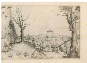
Castle Yard Estimate: £7,000 – 10,000