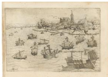
Jonah and the Whale on a Lake with Sailing Vessels Estimate: £5,000 – 7,000

Hirschvogel is the first printmaker to exclusively use the then new technique of etching and one of the first to create prints of landscapes and buildings without any religious or allegorical content ( illustrations below ).