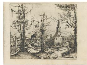
Landscape with a Church Estimate: £3,000 – 5,000

The sale includes other rarities such as the large engraving of the The Massacre of the Innocents by Giovanni Battista de Cavalieri from 1561 after a now lost painting by Francesco Salviati (estimate: £5,000 – 7,000) and a set of playing cards by Stefano della Bella , the Jeu de la Mythologie (estimate: £8,000 – 12,000), devised by Cardinal Mazarin for the education of King Louis XIV of France, when still a child.