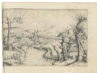
Landscape with a winding wooden Bridge Estimate: £6,000 – 8,000