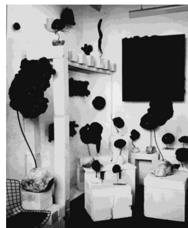
Relief Éponge Bleu in 'Bas-Reliefs dans une forêt d'éponges', Galerie Iris Clert, Paris, 1959 ▶

"In the 1950s I didn't believe in anything irrational. Nevertheless I shared two irrational moments with Yves Klein: the marriage of gold and blue to form pink, and his leap into the void. For the pink, [Klein] united fringes of blue and gold, which when illuminated with light suddenly appeared fuchsia, pink" (Claude Parent).