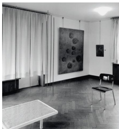
◀ Le Rose du Bleu in 'Yves Klein: Monochrome und Feuer', Museum Haus Lange, Krefeld, 1961