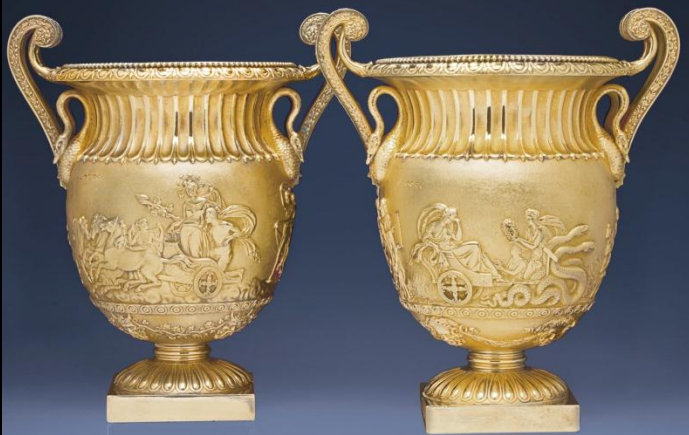
A Fine Pair Of George IV Silver-Gilt Wine Coolers Mark Of Paul Storr, London, 1827 Estimate: $100,000 - 150,000