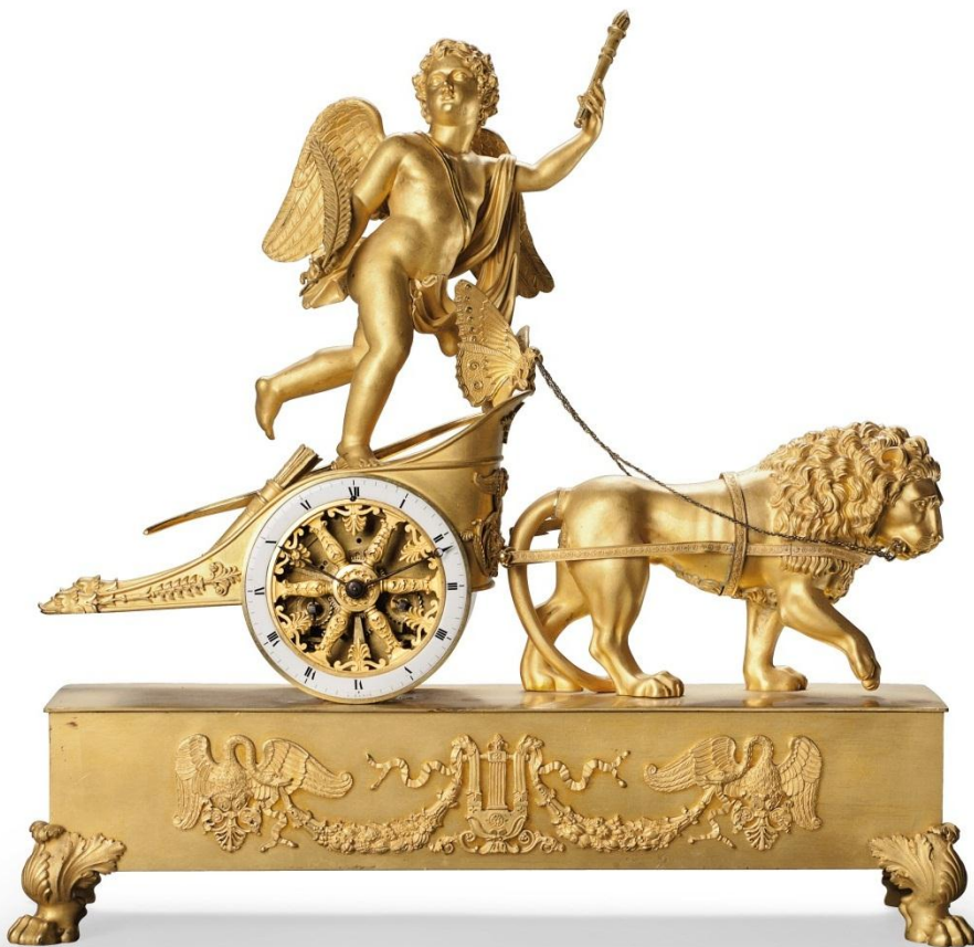
A Charles X Ormolu Mantel Clock Circa 1825 Estimate: $12,000-18,000

Complete catalogue available online at www.christies.com or via the Christie's iPhone app