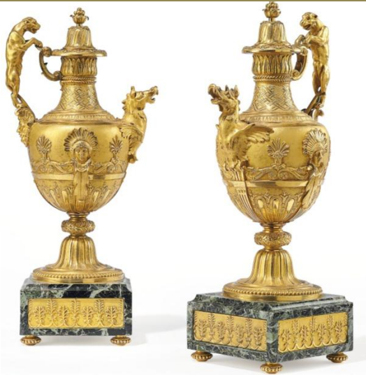
A Pair Of Late Louis XVI Ormolu And Verde Antico Ewers Circa 1790-1800 Estimate: $60,000 - 90,000