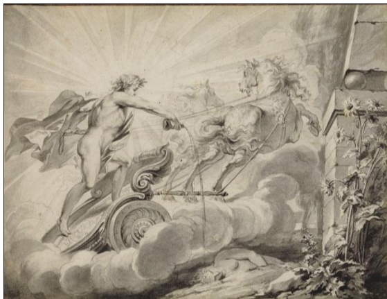
Eighteen illustrations for Ovid's Metamorphoses By Godfried Maes (one of 18 illustrated) Estimate: $40,000-60,000