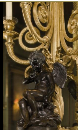
A Pair Of Louis XVI Ormolu, Patinated Bronze And Bleu Turquin Marble Three-Branch Candelabra Circa 1785, After A Model By Etienne Maurice Falconet Estimate: $150,000 - 250,000