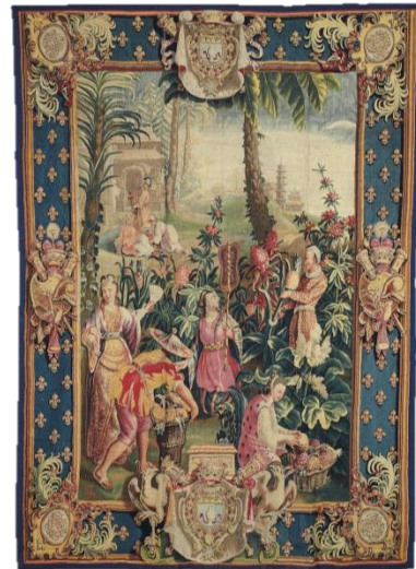
A French Chinoiserie Tapestry Beauvais, Circa 1722-1724, By Noel-Antoine Merou Estimate: $100,000 - 150,000