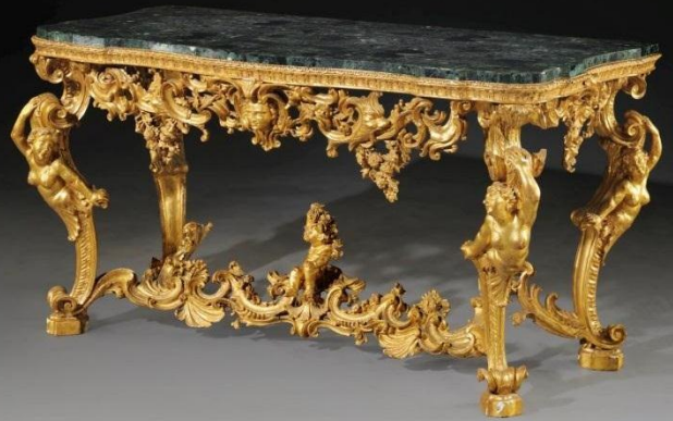
A North Italian Giltwood Side Table Genoa, Circa 1730-40 Estimate: $70,000 - 100,000