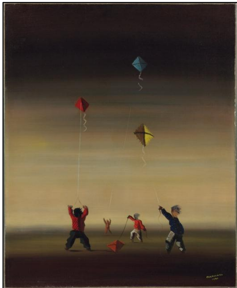
Candido Portinari Meninos soltando pipas , 1941 Oil on canvas Price Realized: $1,443,750 WORLD AUCTION RECORD FOR THE ARTIST