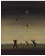
Candido Portinari (Brazilian 1903-1962), Meninos soltando pipas , oil on canvas, painted in 1941. Price realized: $1,443,750