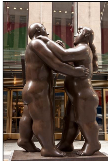
Fernando Botero Dancers Bronze with dark brown patina Price Realized: $1,143,750

New York – Christie's Evening session of Latin American Art achieved an impressive $16,013,250 (£10,568,745 /€12,330,203) and was sold 75% by lot and 74% by value, the highest total since fall 2008. Brazilian modernist Candido Portinari's Meninos soltando pipas realized $1,443,750 (£952,875 / €1,111,688), setting a new world auction record for the artist and the top lot of the sale.