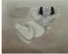
Tilsa Tsuchiya (Peruvian 1932-1984), Mujer volando , oil on canvas, painted in 1974. Price realized: $339,750