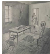
Remedios Varo, Visita al pasado , graphite and pigment on paper, executed in 1957. Price realized: $291,750

WORLD AUCTION RECORD FOR THE ARTIST FOR A WORK ON PAPER