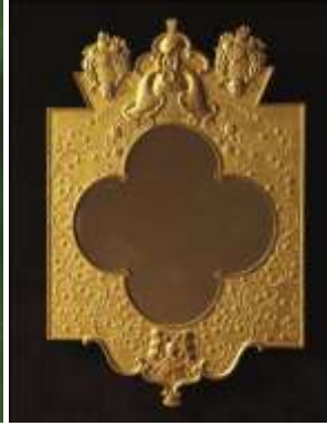
Vienna Secession mirror Austria, circa 1910 Estimate: €3,000 – 5,000