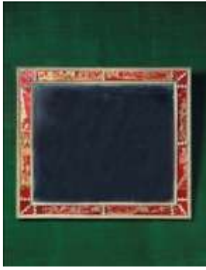
Mirror in eglomise glass Beginning of XVIIIth century Estimate: €12,000 – 18,000