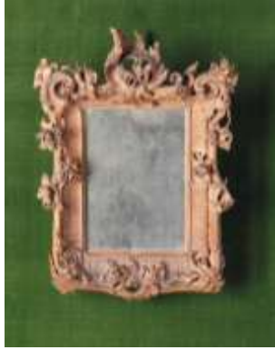
Rococo mirror Germay, middle of XVIIIth century Estimate: €1,500 – 2,500