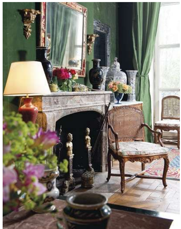
Camoin-Demachy Gallery, on the Quai Voltaire in Paris.