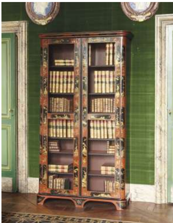
Bookcase, Louis 15th era France, circa 1750 Estimate: €7,000 – 10,000