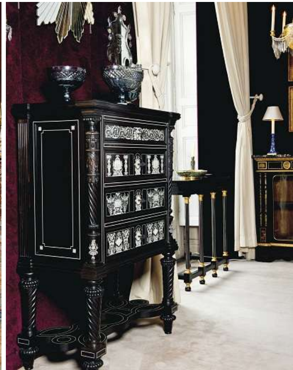
Hunsinger & Wagner Neo-Renaissance ebony cabinet with ivory incrustations France, circa 1880 Estimate: €5,000 – 8,000