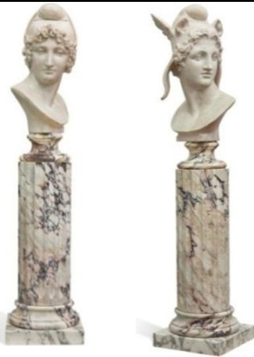
Lot 25 A pair of monumental statuary marble busts of Perseus and Paris, 19 th century after Antonio Canova Estimate: £20,000-40,000