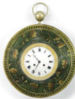
Lot 329 A French Tole-Peinte sedan clock Early 19 th century Estimate: £600-900