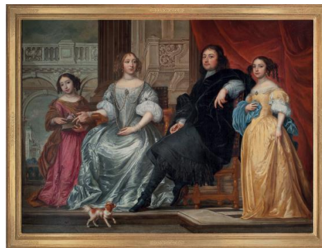
Lot 10 Attributed to Pieter Thijs (Antwerp c. 1624-1677) A family portrait in an interior Oil on canvas, 185.4 x 252.7 cm Estimate: £15,000-25,000