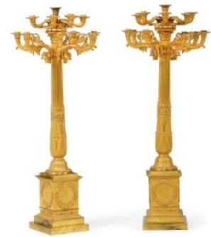
Lot 15 A pair of unusually large ormolu candelabra by Pierre-Philippe Thomire, circa 1820 Estimate: £20,000 – 40,000