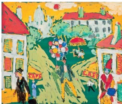
Lot 71 Fikret Muallâ (1903-1967) Café Catherine gouache on paper, 54.5 x 64.5 cm. Estimate: £6,000-9,000