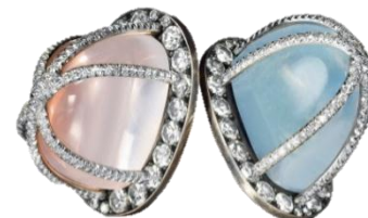
A pair of diamond ear clips, by JAR Estimate: SFr.40,000-60,000 US$43,000-64,000 €34,000-50,000