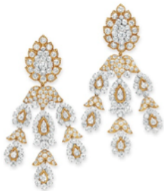
A pair of diamond ear pendants, circa 1965 by David Webb Estimate: $32,000 – 48,000

The collection of The Honorable Noreen Stonor Drexel of Newport, Rhode Island offers some of the finest examples of David Webb jewels from the 1960s and 1970s ever presented at auction. Highlights include: