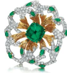
An emerald, diamond and gold brooch, circa 1965, by David Webb Estimate: $25,000 – 35,000