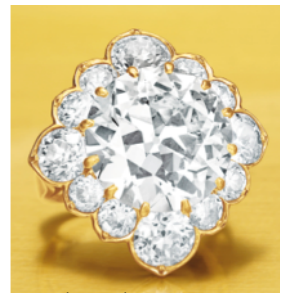
A diamond ring, circa 1970, by David Webb Estimate: $450,000 – 650,000