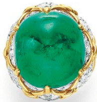
An emerald and diamond ring, circa 1965, by David Webb Estimate: $30,000 – 50,000