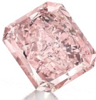
A Rectangular-Cut Fancy Intense Pink Diamond Ring of 8.77 carats Estimate: $5,500,000 – 6,500,000