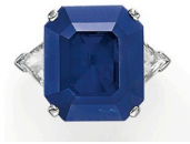
A Burmese Sapphire Ring of 13.18 carats, circa 1955, by Van Cleef & Arpels Estimate: $350,000 – 500,000

PRESS CONTACT: GABRIEL FORD | +1 212 636 2680 | GFORD@CHRISTIES.COM