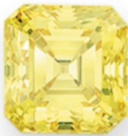
A Square-Cut Fancy Vivid Yellow Diamond of 5.13 carats Estimate: $200,000 – 300,000

Fancy Intense Pink, Vivid Blue and Vivid Yellow Diamonds Dazzle in a 400-Lot Auction of MAGNIFICENT JEWELS on October 15 at Christie's New York