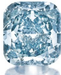
A Cushion-Cut Fancy Vivid Blue Diamond Ring of 3.81 carats Estimate: $2,500,000 – 3,500,000

New York – Christie's New York begins the fall auction season with an exceptional line-up of fine jewels, important diamonds and rare colored gemstones to highlight its sale of Magnificent Jewels on October 15. In keeping with collector demand after the historic sale of the Princie Diamond , the most valuable Golconda diamond ever sold at auction, this sale offers a trio of colored diamonds of superior quality, depth of color, tone and saturation.