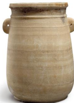
A Phoenician Alabaster Vase, Circa 5 th Century B.C. Estimate: $12,000-18,000