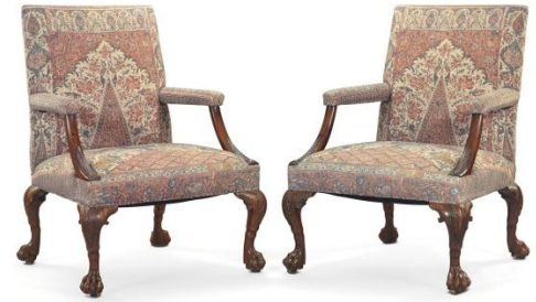
A Pair Of Mahogany Library Armchairs Probably Irish, 19 th Century Estimate: $15,000-25,000