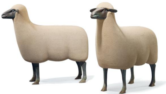
Francois-Xavier Lalanne (1927-2008), 'Mouton De Pierre' A Pair Of Sheep Designed Circa 1979, epoxy stone, patinated Estimate: $150,000-250,000