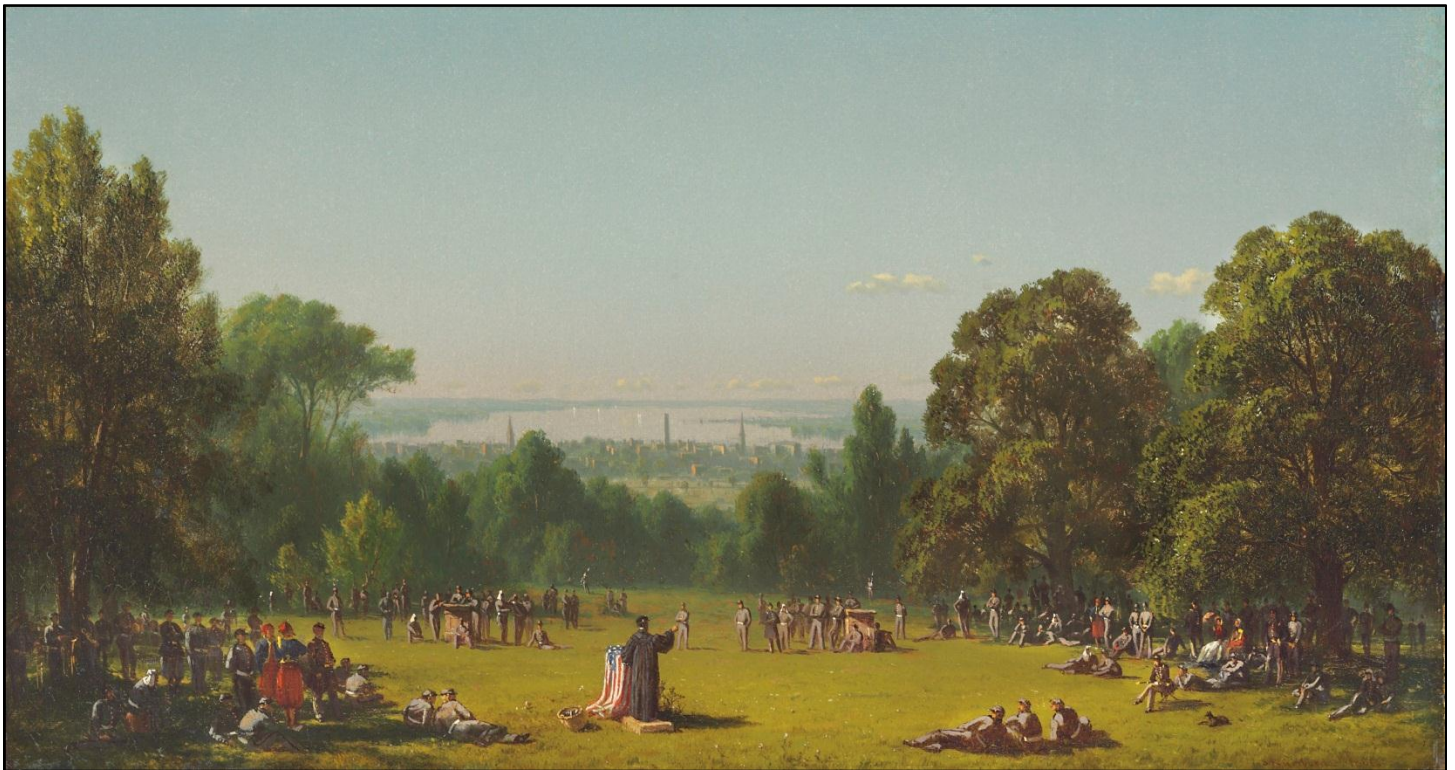
Sanford Robinson Gifford, Sunday Morning in the Camp of the Seventh Regiment near Washington, D.C., in May 1861 oil on canvas, 16 ½ x 30 in. Estimate: $3,000,000-5,000,000

CIVIL WAR MASTERPIECE BY SANFORD ROBINSON GIFFORD TO BE OFFERED IN CHRISTIE'S DECEMBER SALE OF AMERICAN ART