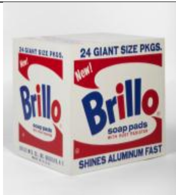
© 2014 The Andy Warhol Foundation for the Visual Arts, Inc. / Artists Rights Society (ARS), New York

oil on canvas 32 1/4 x 44 in. (82 x 112 cm.) signed, titled and dated '724-1 Richter 1990' (on the reverse) Painted in 1990