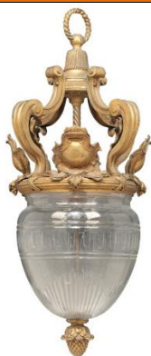
A large French gilt-bronze and cut-glass lantern Early 20 th century Estimate: £7,000-10,000