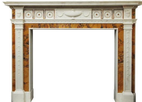
A George III Statuary and Sienna Marble Chimneypiece Late 18 th century Estimate: £50,000-80,000