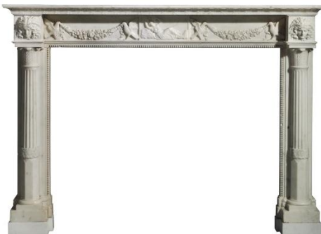
An Italian Carrara Marble Chimneypiece circa 1830 Estimate: £12,000-18,000