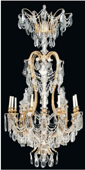
A pair of large and impressive French thirty-light chandeliers from Luton Hoo, early 20 th century Estimate: £25,000-35,000