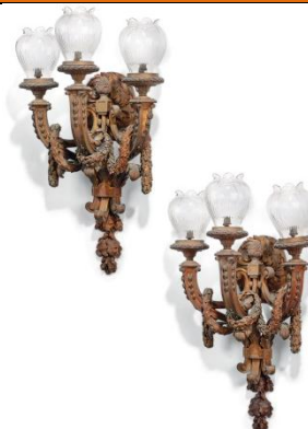
A Pair of large French bronze three-light wall appliques Early 20 th century Estimate: £6,000-10,000