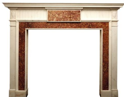
An English White and Brocatello Marble Chimneypiece Elements late 18 th century and later Estimate: £12,000-15,000