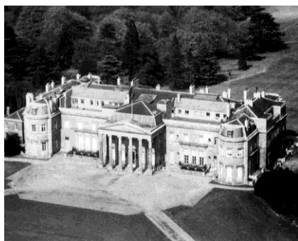
Luton Hoo, Bedfordshire